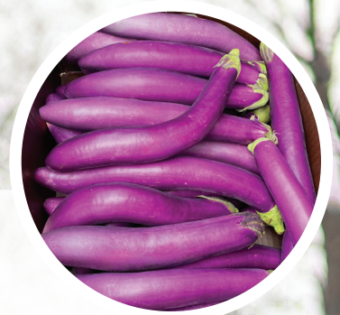
Local Purchasing Program a Win-Win for Farmers and Families