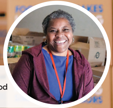
Network Pantry Serves Harambee Neighborhood for Over 25 Years