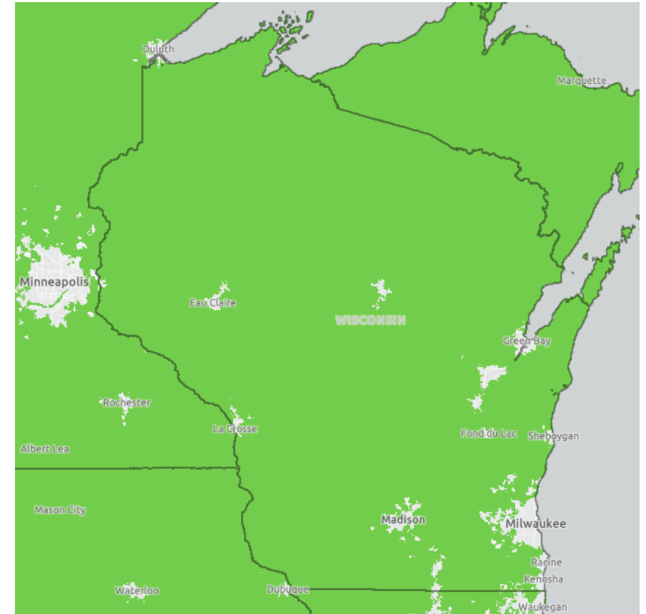
USDA Rural Designation Map