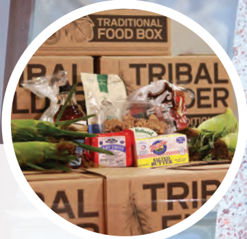
Supporting Indigenous Families with Culturally Familiar Food