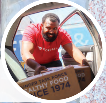
Delivering Stockboxes to Homebound Seniors with DoorDash