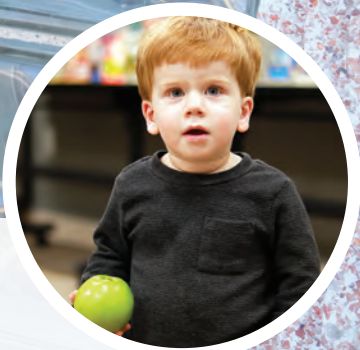
Advocating for Policies That Feed Local Kids, Families & Seniors