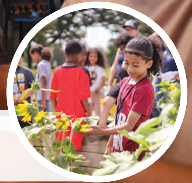
Explore Ways to Support Free & Local This Season