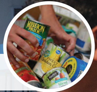
Food Drives Amplify Impact During the Holidays