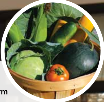
Harley-Davidson Foundation Renews Commitment to The Farm