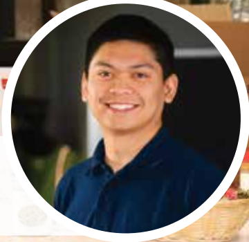
Meet Our FoodShare Advocates