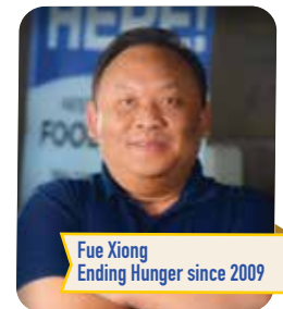
Fue Xiong Ending Hunger since 2009