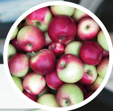
Record Farm Harvests