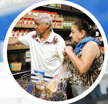
Local Pantry Need on the Rise

STOCKBOX HUNGER TASK FORCE FEEDING PEOPLE TODAY. ENDING FUTURE HUNGER. This institution is an equal opportunity provider.