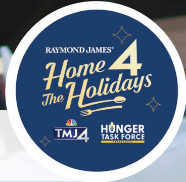
Exciting Winter Events